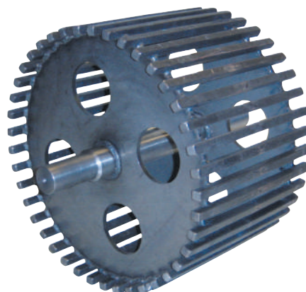
Bechtel open pulley