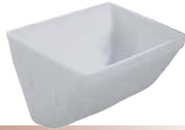
CC-S elevator buckets (parameters in mm)

The CC-S type is a high-capacity elevator bucket. This bucket, with its extra-thick walls, is exceptionally durable. Available in HDPE and nylon versions.